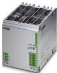
Primary-switched TRIO POWER power supply for DIN rail mounting, input: 1-phase, output: 24 V DC/20 A

Please be informed that the data shown in this PDF Document is generated from our Online Catalog. Please find the complete data in the user's documentation. Our General Terms of Use for Downloads are valid ( http://phoenixcontact.com/download )